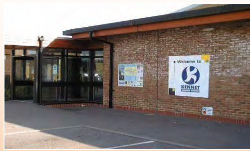
Kennet Leisure Centre

For further details of schools and leisure facilities, please see the list of websites on page 16.